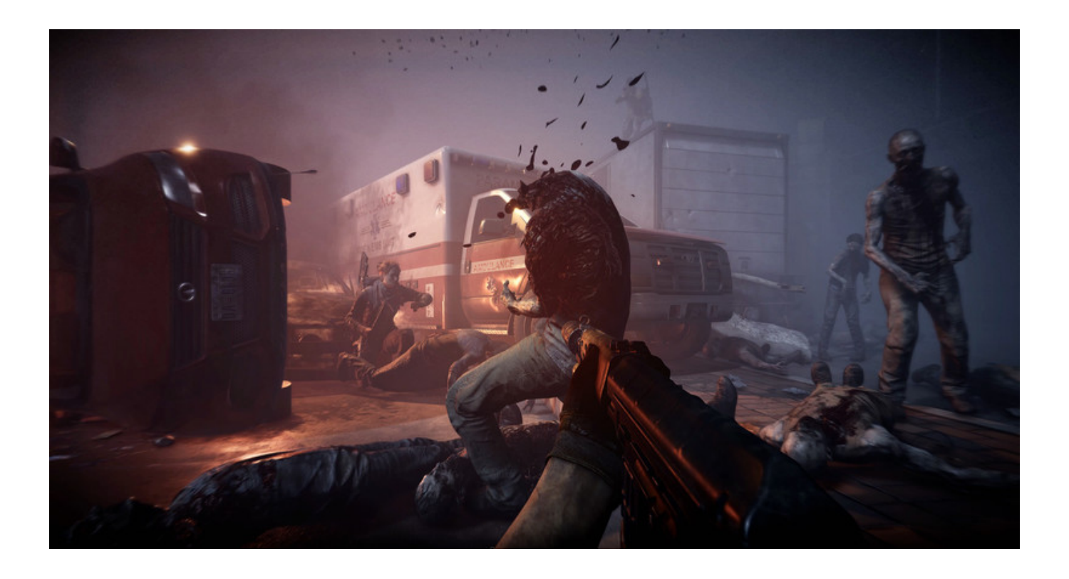
OVERKILL's The Walking Dead: Deluxe Upgrade Download Link

Download ->>> <a href="http://bit.ly/2JoIAev">http://bit.ly/2JoIAev</a>