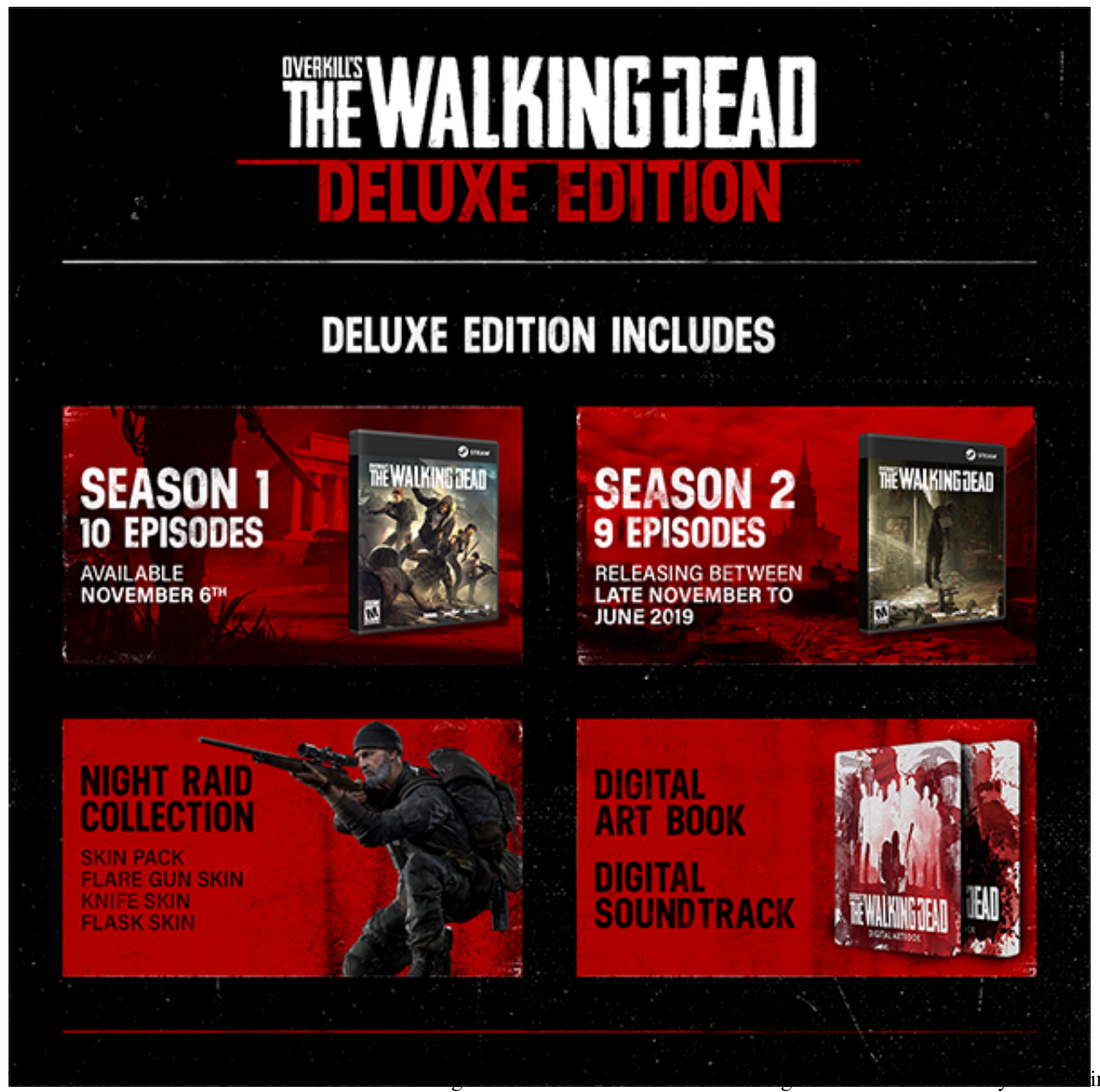
D.C. By upgrading to the Deluxe edition you get the exclusive Night Raid skin-pack for all characters, complete with a flask and knife, along with the soundtrack and digital art book.